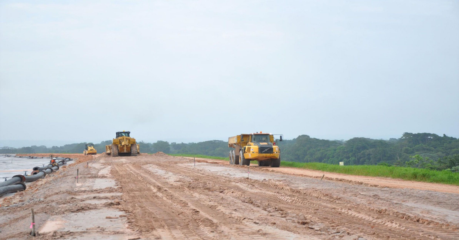
CONSTRUCTION OF TSF EMBANKMENT RAISE AT IDUAPIREM MINE - TARKWA (RAMOTH SERVICES LIMITED)