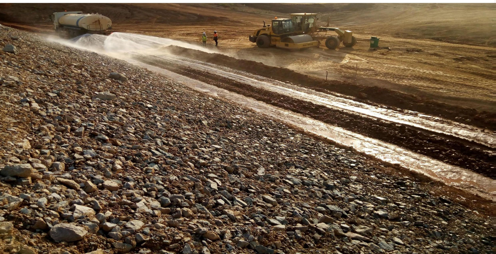
CONSTRUCTION OF GREENFIELD TSF AT CHIRANO MINE - GHANA (RAMOTH SERVICES LIMITED)